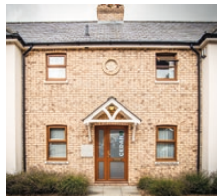
/ CEDAR's headquarters on the outskirts of Cambridge