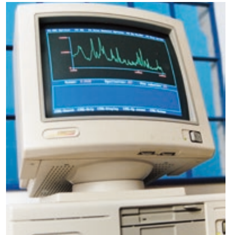
/ The first CEDAR system from 1990, running under MSDOS

The live broadcast and location sound sector of the entertainment industry were next to benefit from CEDAR innovation. Out in the field Reid and Osborn observed multiple microphone channels being fed into a single two-channel DNS unit so the DNS 8 was designed to offer eight channels of live background noise reduction that would 'learn' and adjust as needed, allowing broadcasters to