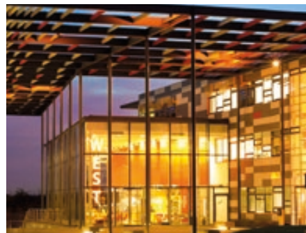
/ The HQ of CEDAR-spinoff AudioTelligence